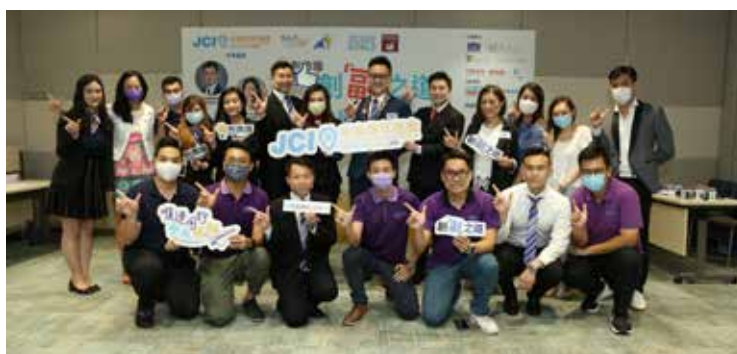
創「副」之道工作計劃圓滿舉辦