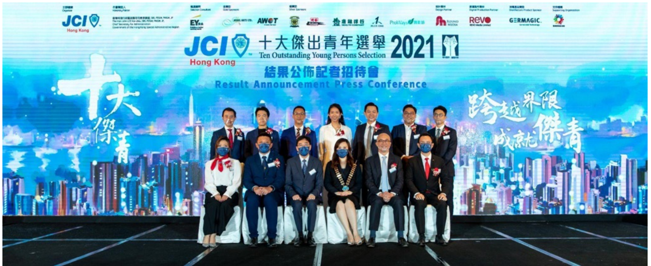
2021 TOYP Awardees, Chief Judge, Selection Consultant, TOYP Association Chairman and JCI Hong Kong representatives

panel in this year's selection. Though all awardees are in different categories, all of them have passions in their professions, sharing a common drive to succeed and overcome challenges to achieve their goals.